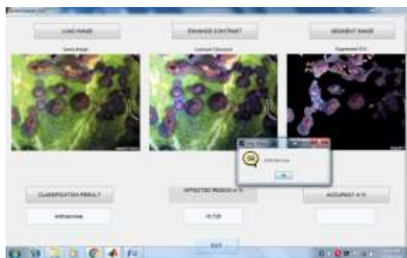
(g) final image of infected leave [15%]