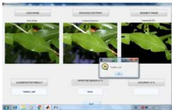
(f) images of healthy leaves