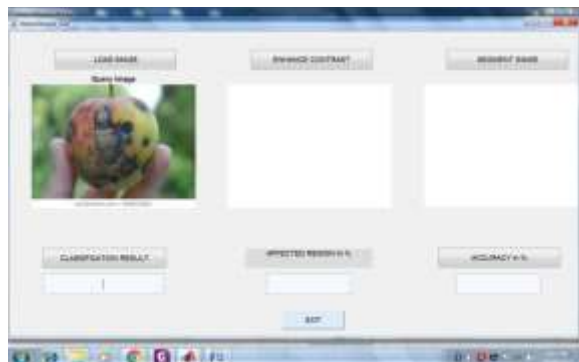
(a) selection of image(fruit/leaves)