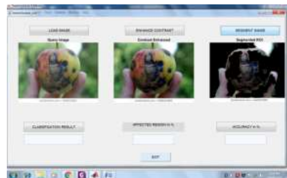
(d) segmented image with Region of Infection