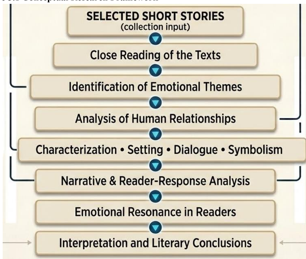
Figure 3.1 Conceptual Research Framework