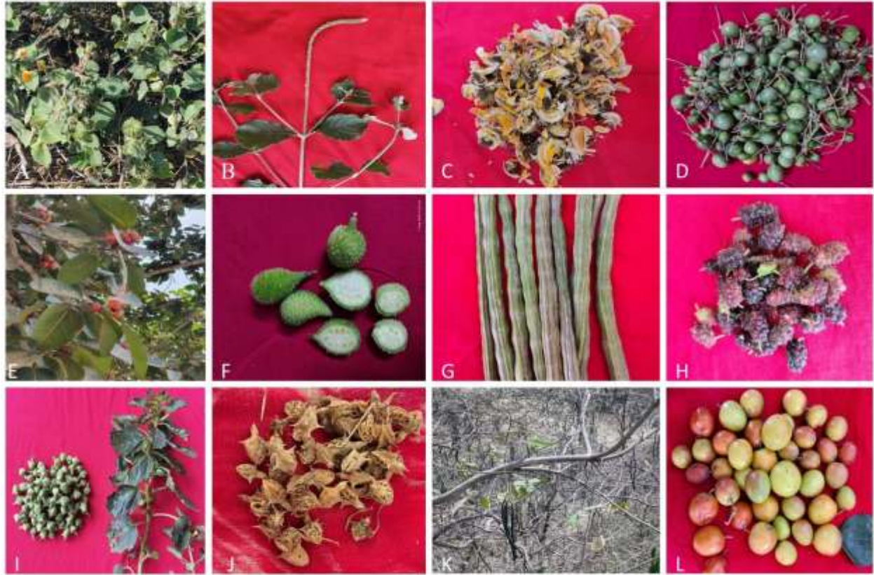
Fig.1 A. Abutilon indicum (L.) Sweet.; B. Achyranthes aspera L.; C. Butea monosperma (Lam.) Taub.; D. Capparis decidua (Forssk.) Edgew.; E. Ficus benghalensis L.; F. Momordica diocea Roxb.; G. Moringa olifera Lamk.; H. Morus alba L.; I. Pedalium murex Linn.; J. Tribulus terrestris L.; K. Zizyphus nummularia (Roxb.) R. Br.; L. Zizyphus nummularia Mill.

specimen was prepared. The Wild edible plants were identified based on their edible parts such as fruits, leaves, seeds and flowers.